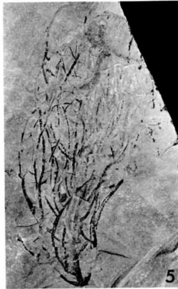
BANKS, Late Silurian land plants